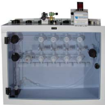
Shown: Customized VMB-04-PF-ACV