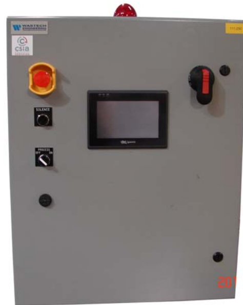
Control Panel — Dual removable drum cabinet system with remote mount version.

Discharge Pump Flow Curve — For fixed drum cabinets only. System is designed to discharge one drum at a time. Both single and dual drum cabinets have one discharge pump. The drum to be discharged is selected by the operator on the control panel.