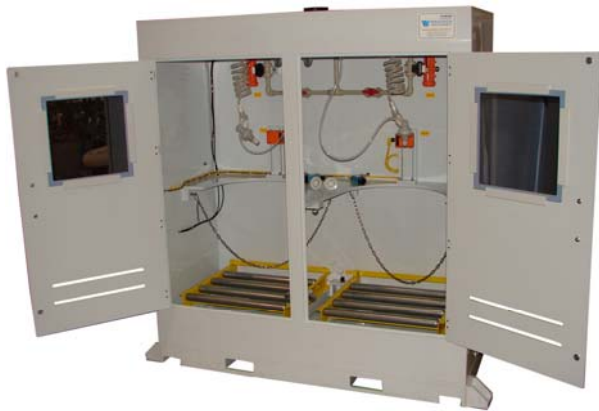
Shown: Dual cabinet with removable drums. (CCC-2-R-RP)

Wastech standard chemical collection cabinets are designed for safely and efficiently collecting and storing chemicals and other non-flammable hazardous liquids.