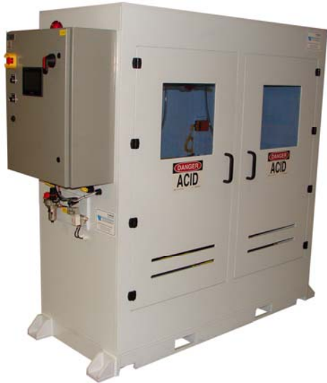
Shown: Single cabinet fixed drum solvent collection system. (CCC-1-F-RP-P)