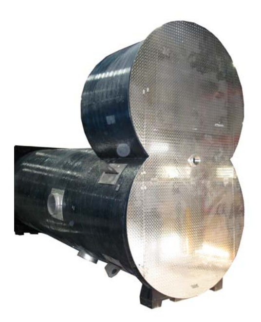
Shown: 2500 gallon triplex pump lift station with side inlets, CPVC piping, and multiple hatches for equipment and valve access.