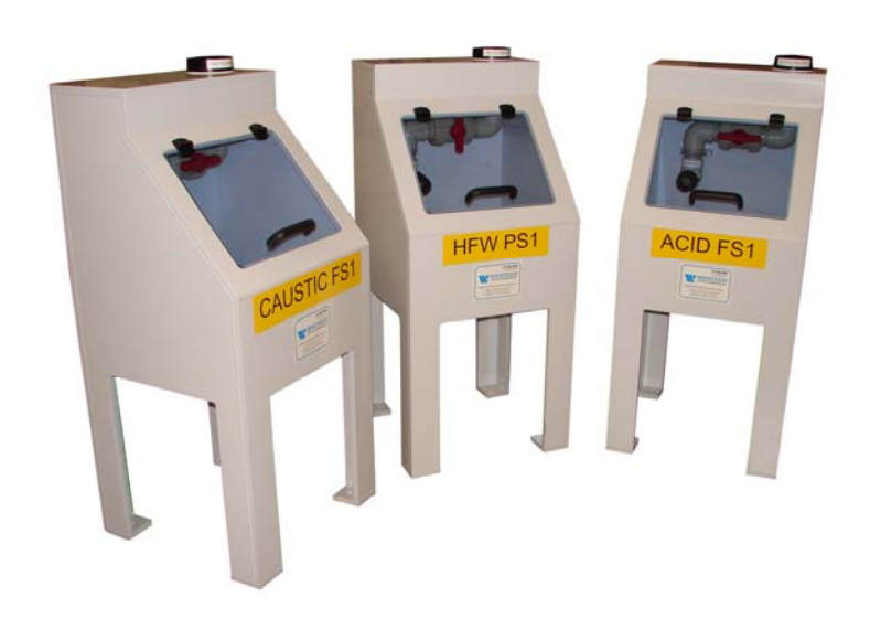
Specifications subject to change without notice